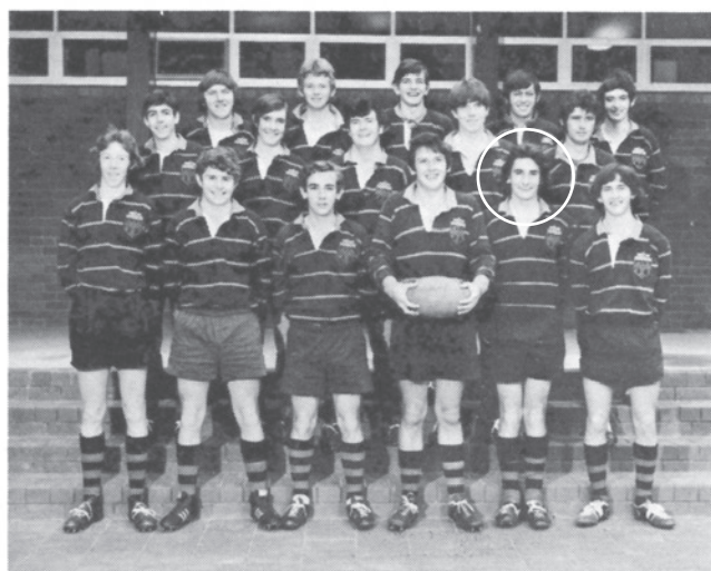
FIRST FIFTEEN 1970