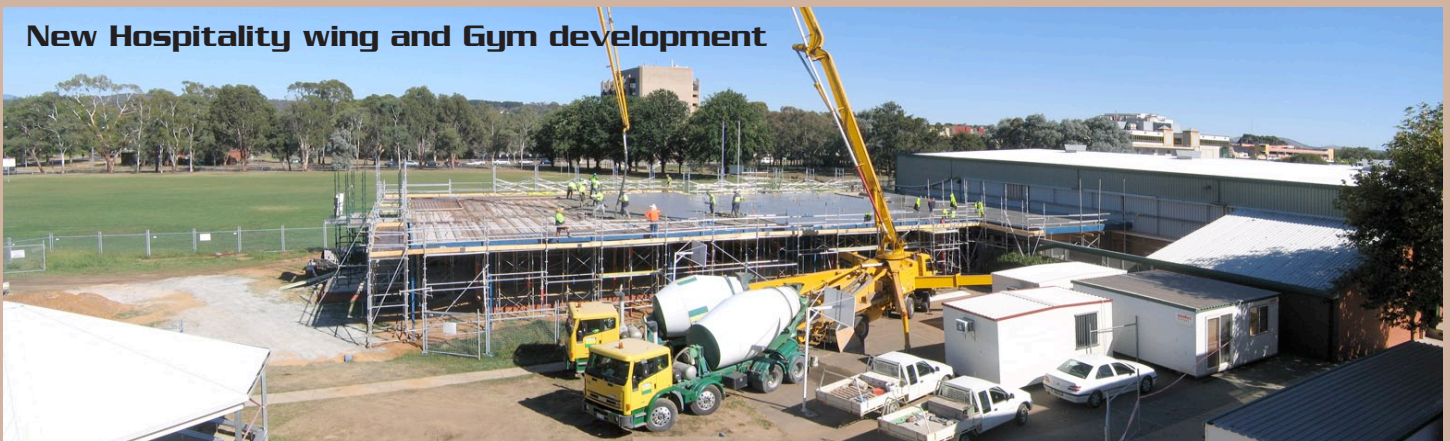
New Hospitality wing and Gym development

The College building program for 2008 has so far come in on time and on budget.