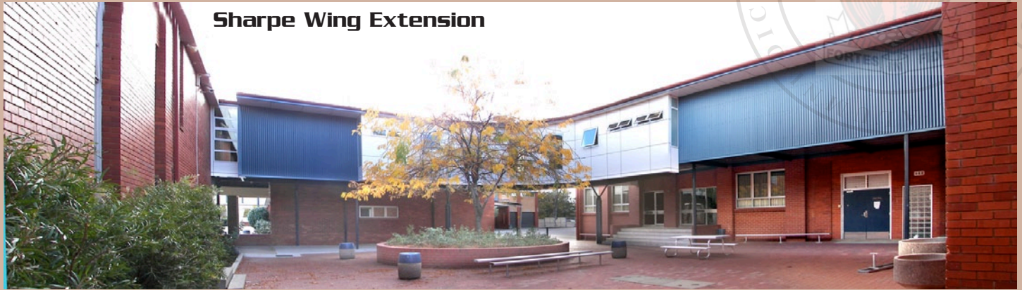
Sharpe Wing Extension